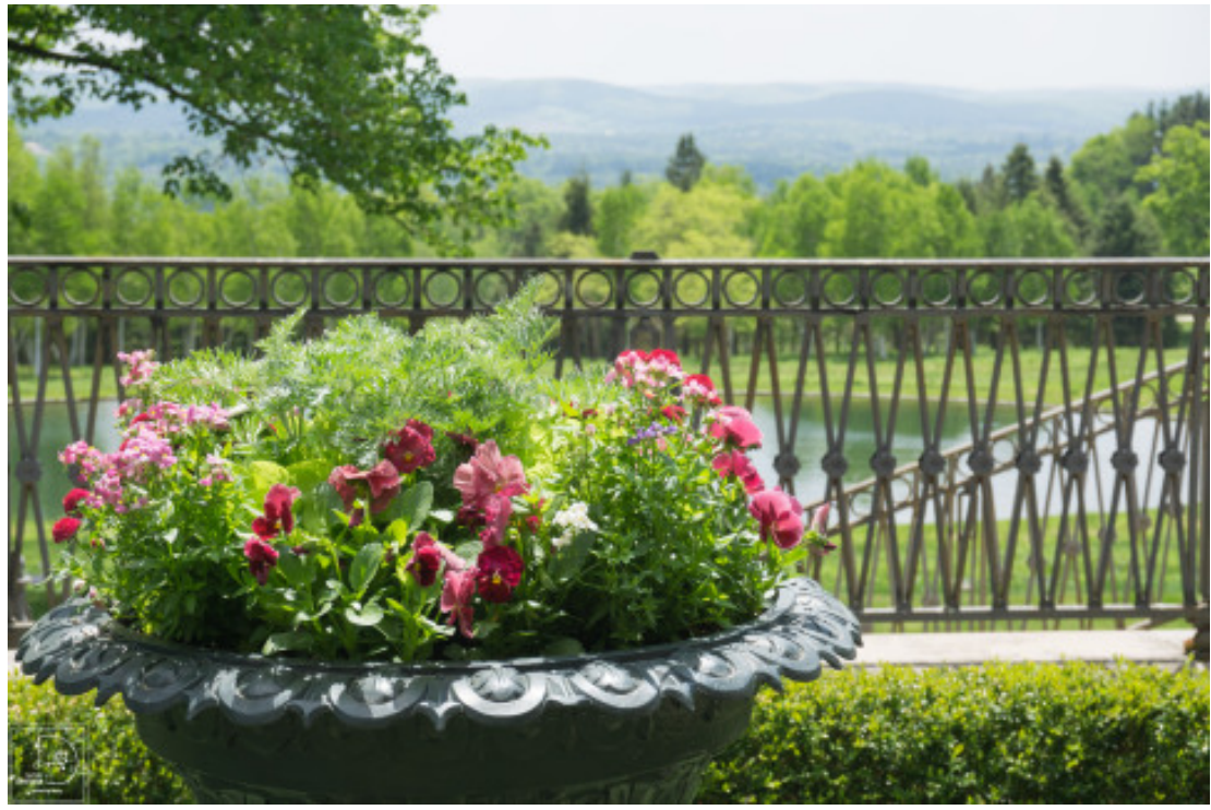
Twin Maples, Salisbury, Ct

Join us for a visit to the Berkshires and surrounding region. From our base in Stockbridge, MA, we will explore the area and venture across the Massachusetts border to visit gardens in New York and Connecticut. We begin our tour Monday afternoon with a visit to Naumkeag for a house & garden tour and welcome reception. Tuesday we head to the Berkshire Botanic Garden, then after lunch travel to the Hooper garden in Caanan, NY. Wednesday we visit two amazing private gardens near Salisbury, CT, and a secret garden tucked behind an antique shop. An optional excursion to The Mount in Lenox, MA on Thursday morning rounds out our trip.